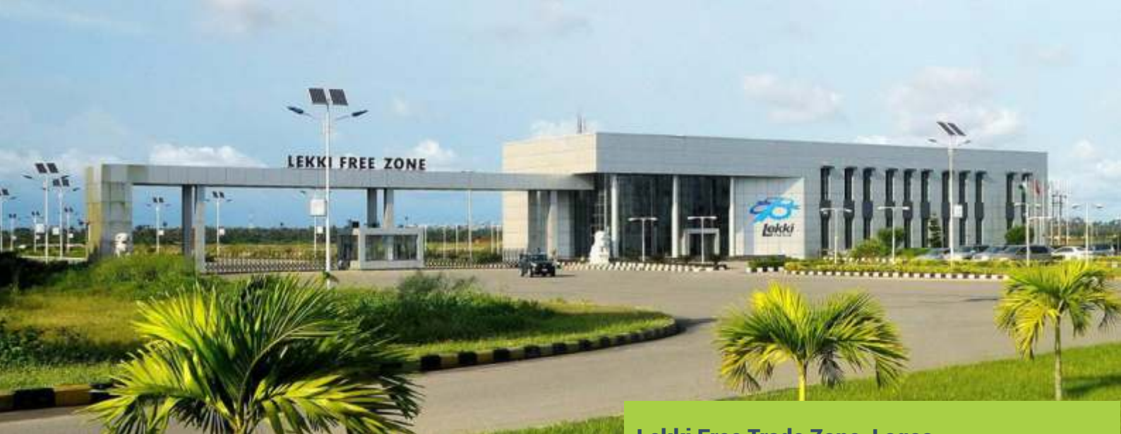
Lekki Free Trade Zone, Lagos