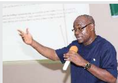
Nigeria Export Processing Zones Authority (NEPZA) Staff Training